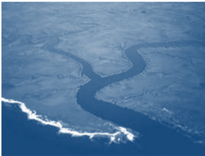
Aerial photo showing a vast amount of saltmarsh and associated estuary.

plants cannot tolerate any exposure to salt. However, smooth cord grass, often called by its generic name, spartina, has evolved the ability to withstand regular inundation by saltwater. Spartina dominates the low marsh to the exclusion of almost all other plants, creating a very unusual habitat. Spartina stalks are thick, very tough and well anchored by a root system. The plant's narrow, tough blades and special glands that secrete excess salt, making it ideal to withstand the high heat and daily exposure to salt water. The soft marsh substrate, referred to as "pluff mud," prevents large grazing animals from consuming living spartina stalks. Instead, the grass dies back each fall and bacteria decompose it into a rich soup known as detritus that along with algae serves as the basis of the productive salt marsh food web.