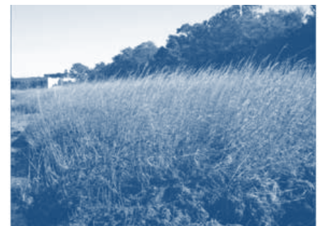
Smooth cordgrass (Spartina)

Spartina grows best in the low marsh and along the meandering creeks where currents constantly replenish soil nutrients. Spartina also grows in the high marsh, but often reaches not much over a foot in